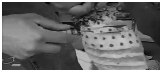
Figure 3: method of salesman for peeling a pineapple

In the data collection session, we go to the classroom and show a picture about peeling the pineapple as below and ask students to explain that Why does the salesman peel the pineapple in this way? Is there any mathematical way for describing salesman manner?