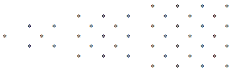
Figure 2. Continuation of the shape pattern in Task 1 invented by Alice and Ida

There are several possible ways to continue the pattern in Task 1 of which the first two geometrical configurations (elements) were given. In the following I concentrate on the alternative identified by Alice and Ida (Figure 2).